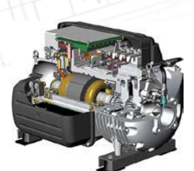
Turbocor compressor cutaway