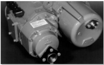
The high speed Carrier 06NA compressor

These machines are suitable for most applications including low temperature refrigeration and ice making. Their compact size and light weight makes them easy to transport and locate in confined areas, suiting them to temporary cooling installations where a portable, compact, powerful machine is required. Sophisticated controls allow them to adapt to all conditions- they keep running!